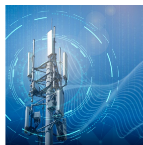
Optical Connections in Harsh Environments