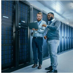
Broadband Service Provider Installations