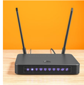
Fiber to the Home Devices