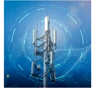
Radio Access Network Devices