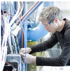
Data and Computing Equipment

Telecommunications equipment Aerospace and defense systems