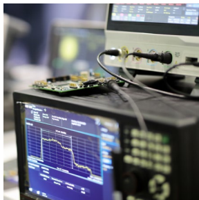
Test & Measurement