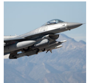
Aerospace & Defense